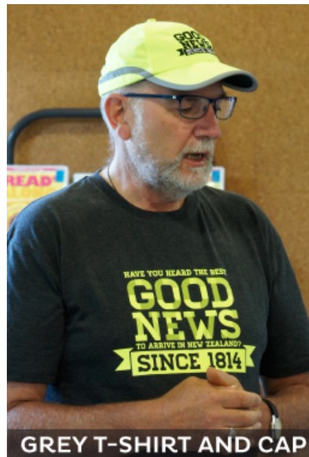
GREY T-SHIRT AND CAP