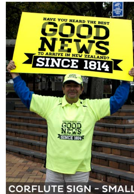
CORFLUTE SIGN - SMALL

As a sign of the continuing pilgrimage, the bright yellow used in the Te Harinui Hikoi will be the mark of our Bicentenary Campaign. Therefore, each parish will receive FREE: